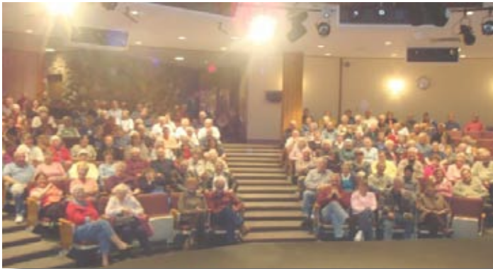
Nicolet College, Rhinelander, WI

As mentioned in our last Newsletter, both Alaska Far Away—The New Deal Pioneers of the Matanuska Colony and its predecessor Where the Matanuska River Flows continue to be shown both in Alaska and the Lower 48.