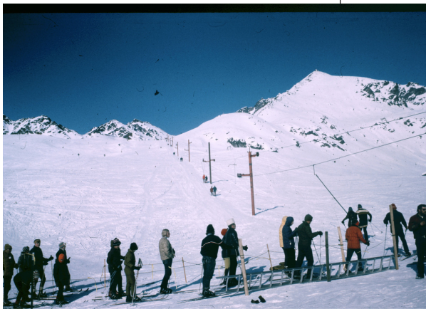
Independence Mine Lift Line—1970's