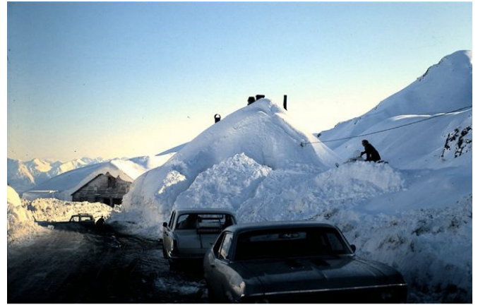
Snow Buried House at Independence Ski Resort

Ben's stories were entertaining and demonstrated what it took to put together an off the grid grass roots ski area that had heat, lights, and a rope tow and T-bar ski lifts. It seemed clear that the critical components included acquiring a D-8 cat, an accommodating banker, and the help of the ski patrol. Ben's stories about the trials and tribulations of keeping the road open included the time