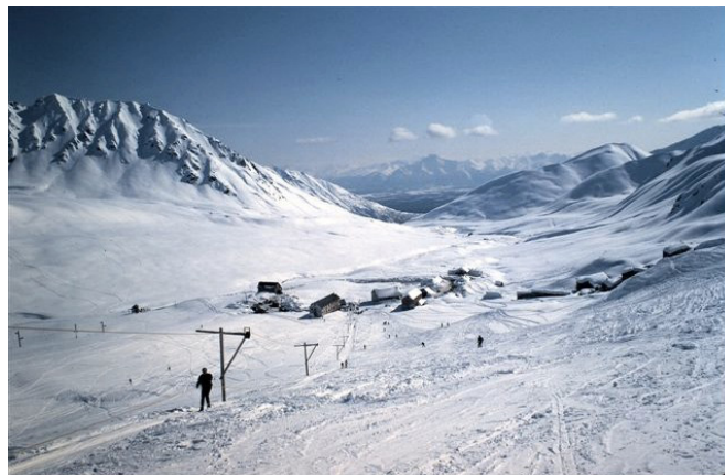
Independence Mine T-Bar