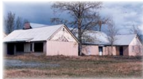
Photo of the Colony Buildings circa 1997.