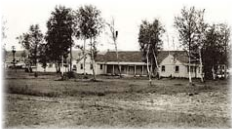
The Matanuska Colony Recreation Center circa 1938.