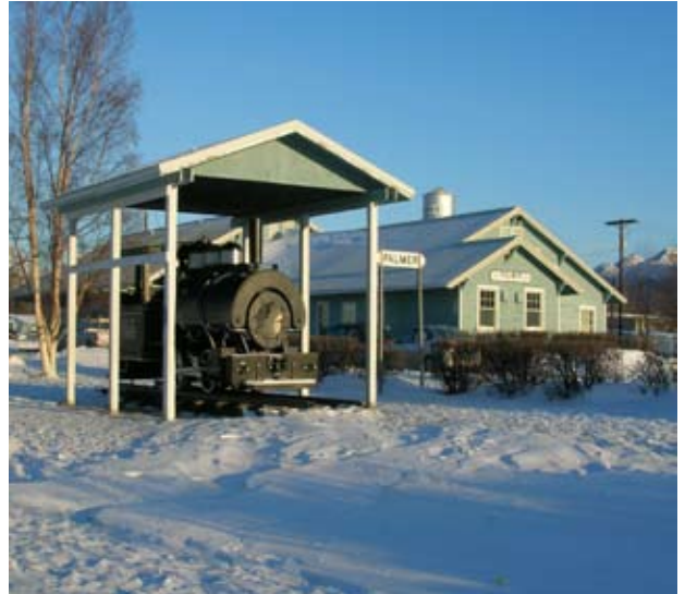
The 2008 Colony Museum Tree

As always, the public is cordially invited to attend!