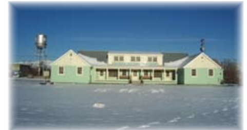
The Palmer water tower serves as a wonderful backdrop to Dahlia Street Market 2008.

visit our website at www.palmerhistoricalsociety.org