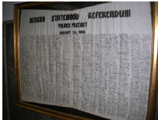
The Referendum for Statehood signed by voters in the Palmer Precinct hangs in our very own Palmer Library