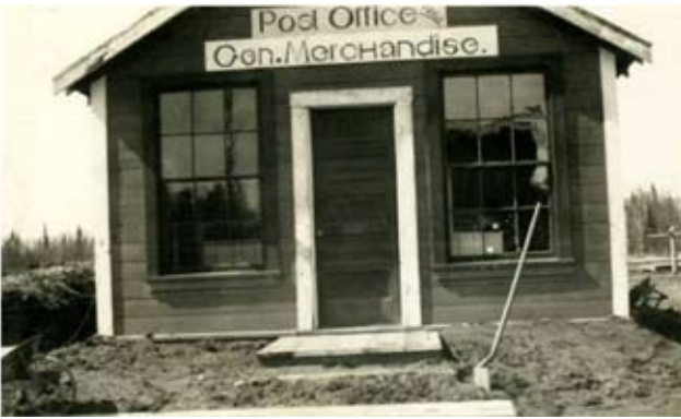
Photo 1 shows the store in early 1935 in its current location, apparently recently moved. (UAA-HMC-0413)